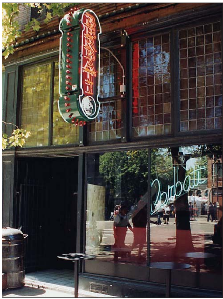
Projecting Neon Sign