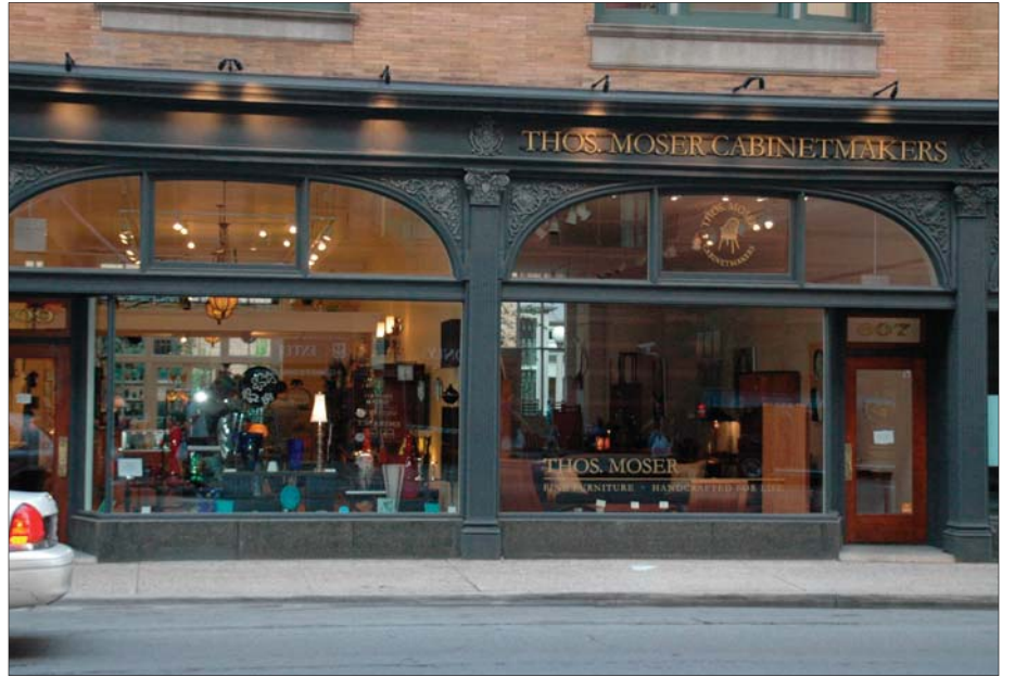
above: Individual letters mounted on intermediate band and painted letters on storefront glass