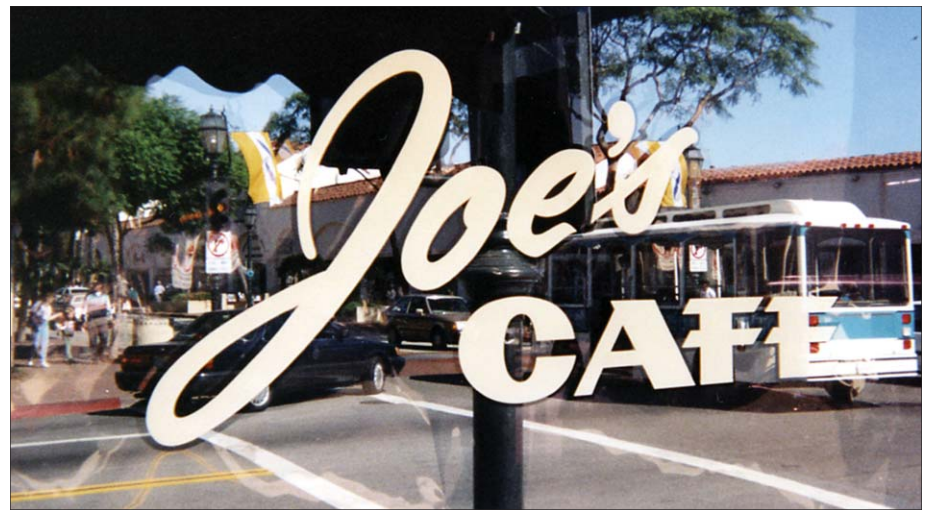
Wall Mounted Sign