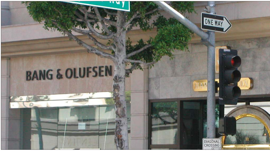
Wall-Mounted, Individual letter sign