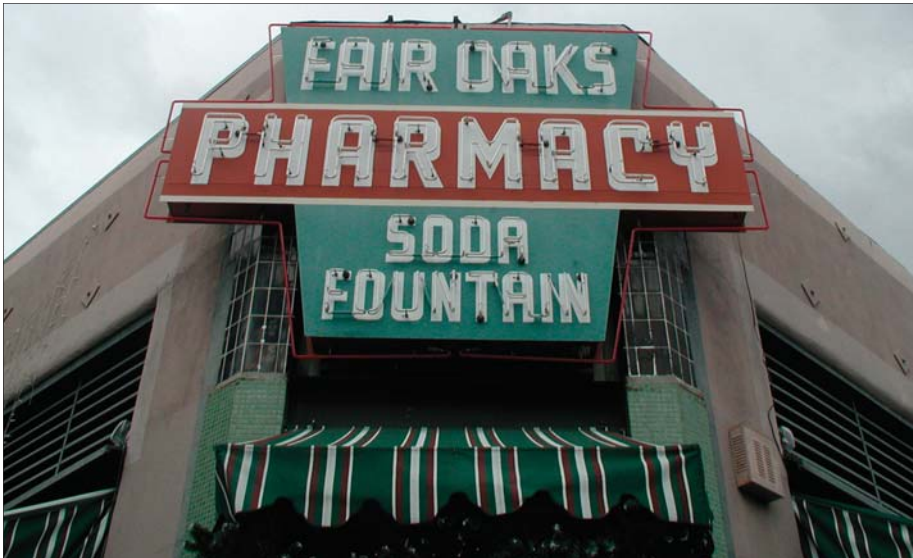
Large Wall-Mounted Neon Sign